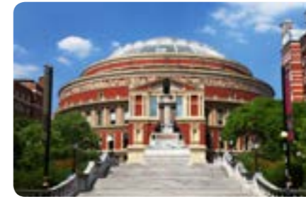
Royal Albert Hall