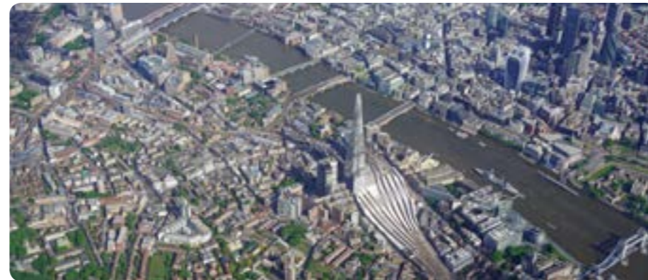
Aerial view of London

A city is a large, busy settlement where lots of people live and work. A city usually has a cathedral, a river, important buildings and offices where people work. There are lots of things to see and do in a city. There are many shops and restaurants to visit.