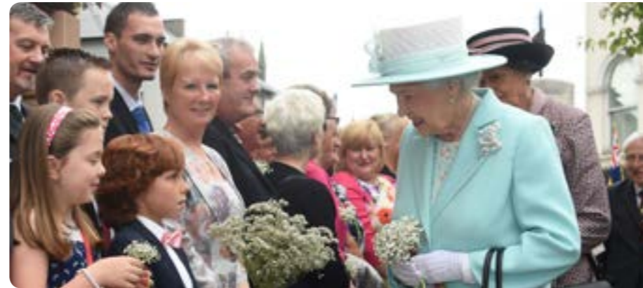
The Queen meets lots of people.

Elizabeth II is the Queen of the United Kingdom. She was born in 1926 and became queen in 1952. The Queen is married to Prince Philip and has a large family. She lives in Buckingham Palace in London. The Queen is very important. She visits charities and schools in the United Kingdom and welcomes world leaders to Buckingham Palace.